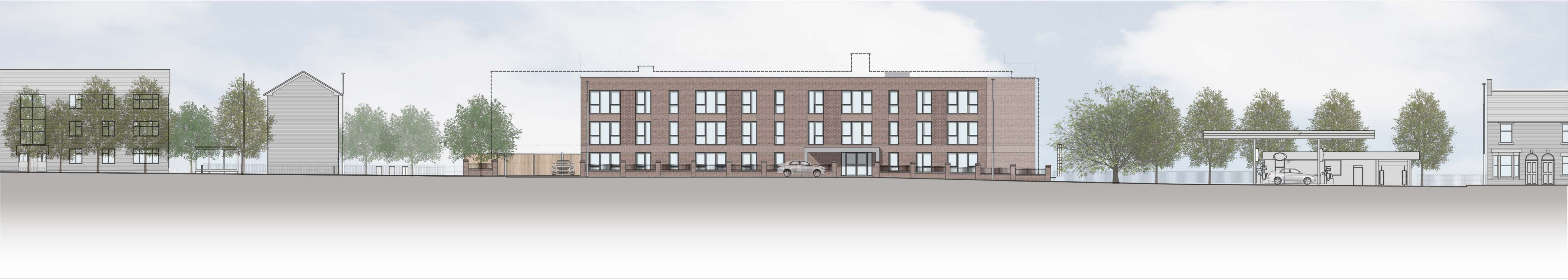
Proposed Ashton & Droylsden Road Street Scene 1:200